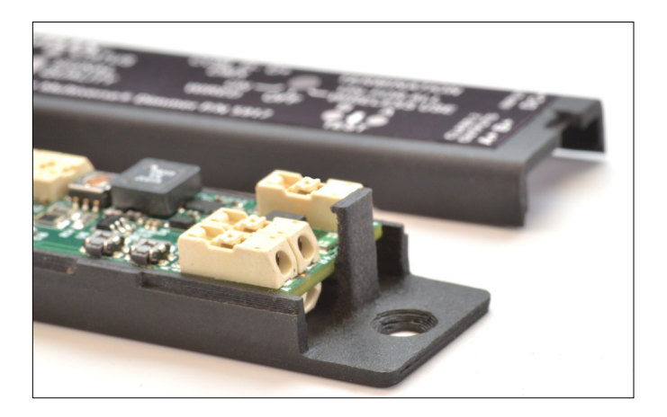
*Multiverse Transceivers are covered by U.S. Patent # 7,432,803 and other patents pending.